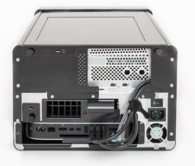
LTNG-XD-8-MMDT door closed.